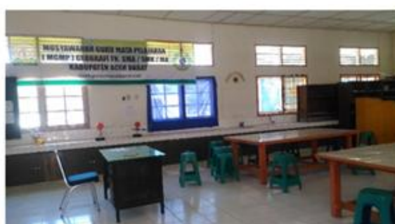
Fig. 2. Representation of Actual situation of laboratory work in majority of senior high school in west Aceh, Meulaboh

the picture shows actual situation from sample we taken. this showing not sufficient for sort of secondary school laboratory. although the minimal standard of laboratory can be fulfilled, it can not guarantee that knowledge transfer to student is happen properly. allen and white (1999) explained that some competencies need to be met were 1) critical thinking, analyse, solve the problem, 2) find, evaluate, and using appropriate knowledge resources, 3) cooperate teams and small groups, 4) oral, written skill effectively, 5) use content knowledge and intellectual skill to be a contious learner. Gokhal (1995) explained that cooperative learning is also the best way to reinforce student critical thinking in practical knowledge leading to the success of education process. and cooperative learning can be done by labaratory work when it is supported by good quality and sufficient equipment.