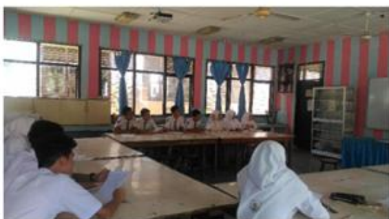
Fig. 1. to depict the actual documentation of lab work

to depict the actual documentation of lab work. we captured some pictures during the learning process. the condition of learning process in school sample is represented in fig. 2.